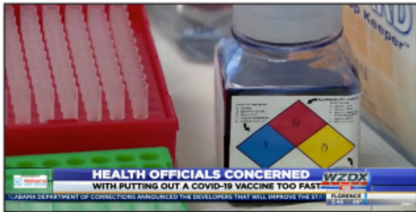
“Health Officials Worried About Rushing COVID-19 Vaccine Out Too Quickly.” Fox54 News. 2020. :55.

Students analyze two short news videos about the safety and speed of the creation of the mRNA Covid vaccine, about sourcing and credibility of the videos and the scientific information presented in them, and about their own confirmation biases.