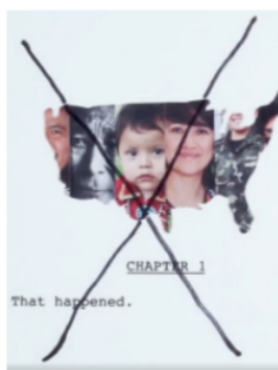
The Invention of Thanksgiving. National Museum of the American Indian.

Students analyze short videos for messages about the meanings and impacts of the stories surrounding Thanksgiving.