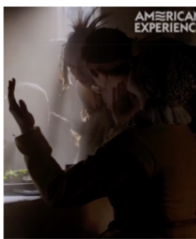
The Pilgrims and the First Thanksgiving. PBS American Experience.