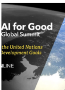
A Window to a Better World: AI for Good. United Nations. 2020.

Students analyze four short videos for messages about the pros and cons of artificial intelligence, the bias and credibility of each source, and our own thinking about the issue.