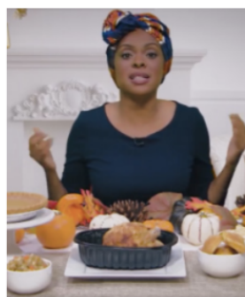
When is Thanksgiving Day and Why is it Celebrated? AlJazeera AJ+.