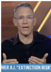
Could AI Lead to Human Extinction? NBC News. 2023.