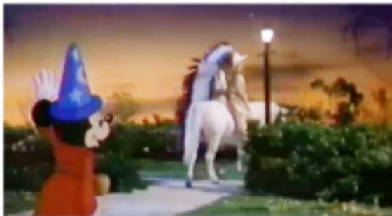
M & M Commercial, 1988, :35 sec.

Students analyze a commercial and video analysis for messages about cultural appropriation in Halloween costumes and how identity impacts responses to media.