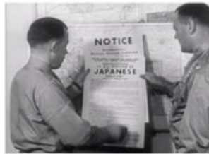
Japanese Relocation. U.S. Office of War Information. 1943. 3:01.