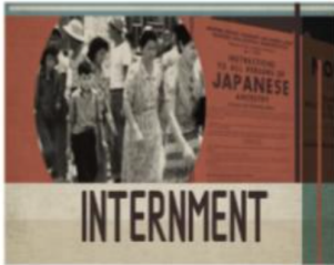
“Japanese-American Internment During WWII.” History Channel. 2017. 3:31.

Students analyze four short video representations about Japanese internment during WWII for messages about the event, how it is constructed, its historical and cultural context, and our understanding of history.